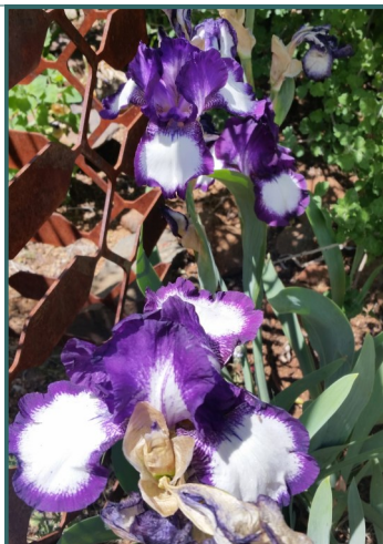
'Stepping Out' (Schreiner 1964)

An Affiliate of the American Iris Society