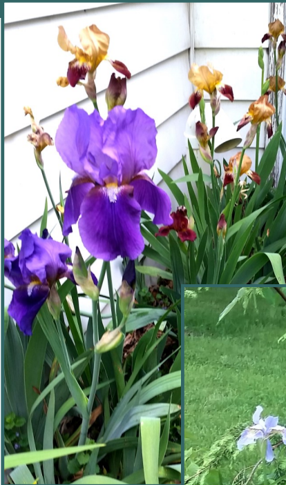
Bottom right corner: at the local Wal-Mart. The rest are in her yard. All NOIDs.