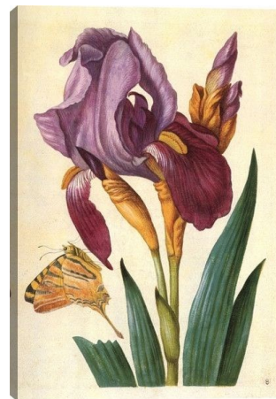
by Maria Sibylla Merian, late 1600s