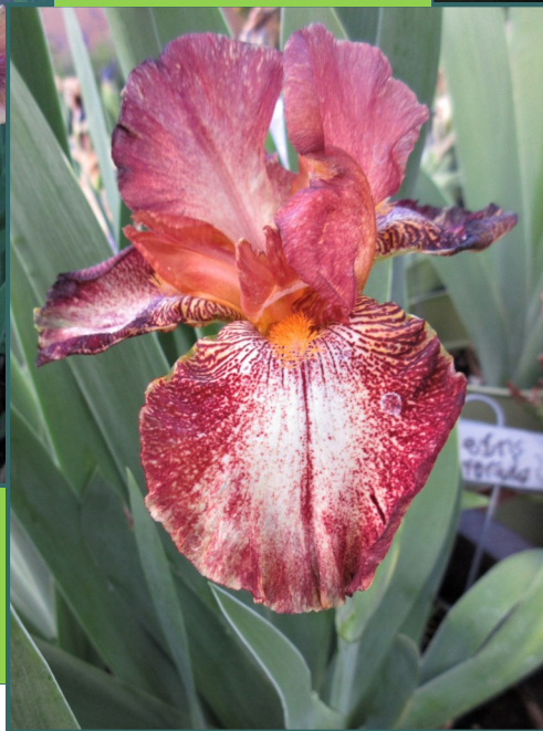
Top row: 'Kathy's Carnival' (Shepard 2005), NOID, 'Frills and Chills' (Burseen 2012)